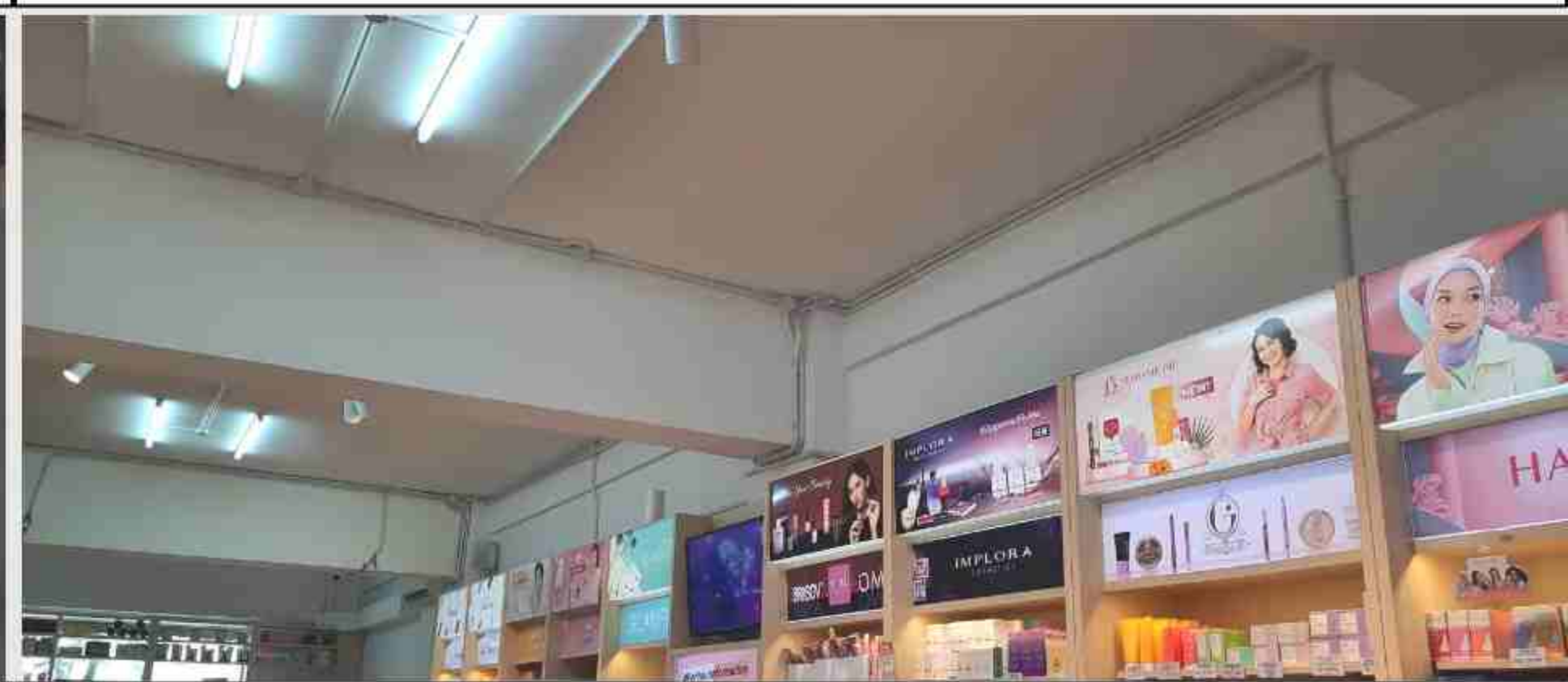
Shortly after that, she gone to the make up store to buy some make up.