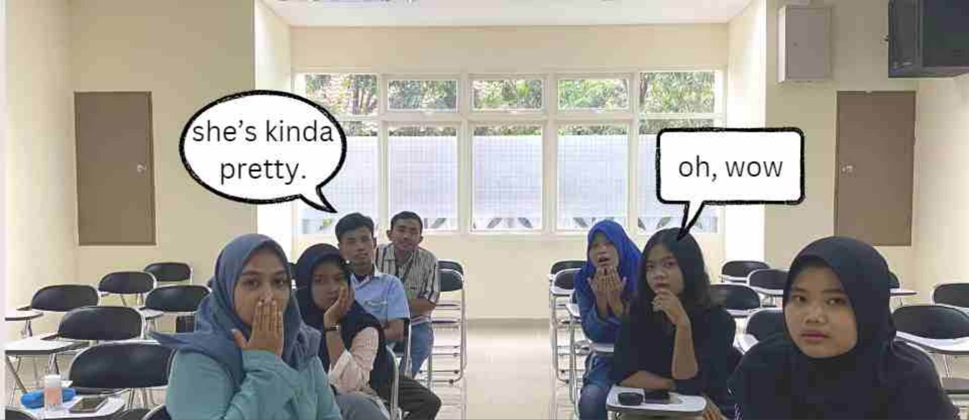
All of her classmates are shocked because of her differences.