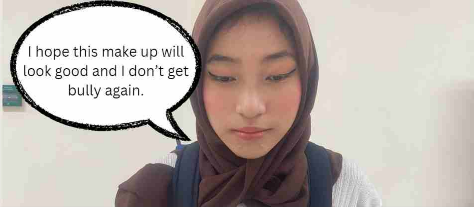
Jukyung tried to do her make up by herself and it looked bad and still messed up.