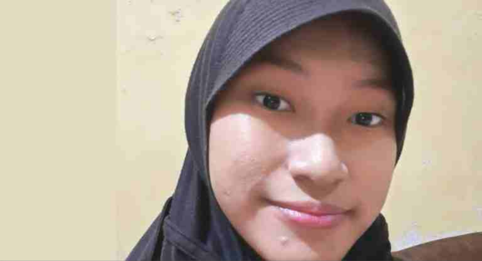
Jukyung tried again her make up but with more naturally and it turns out pretty.