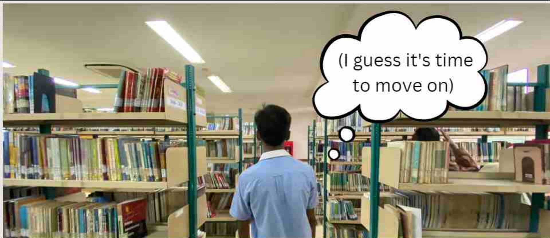
Even everyone know Jukyung as the prettiest but Suho didn't care about it, all that matters to him are her kindness and their same thought to share together.